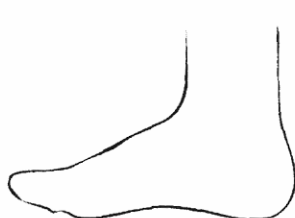
OUTSIDE OF FOOT