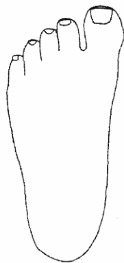
TOP OF FOOT