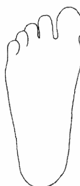
BOTTOM OF FOOT