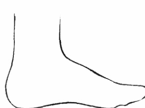
OUTSIDE OF FOOT