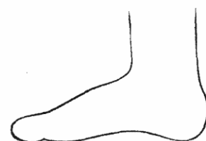
INSIDE OF FOOT