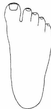
TOP OF FOOT