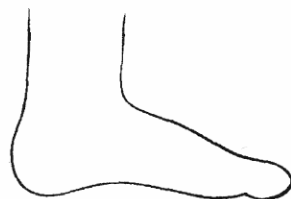
INSIDE OF FOOT